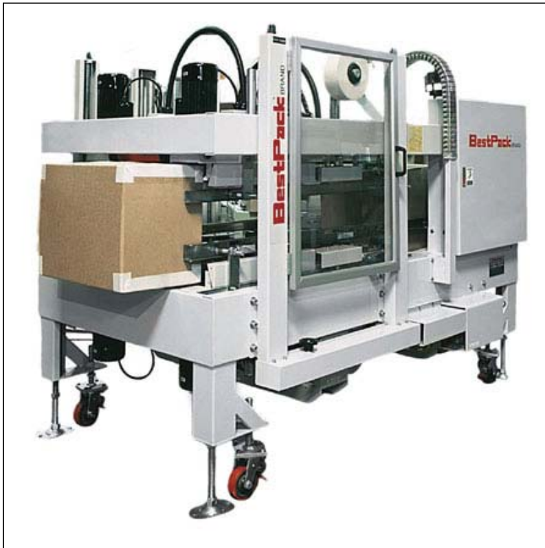
AT4E22 Automatic Top and Bottom Drive Four Edge Carton Sealer