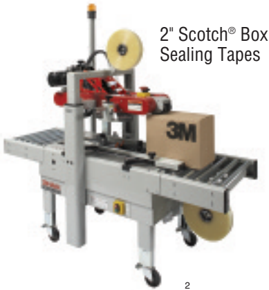
2" Scotch® Box Sealing Tapes